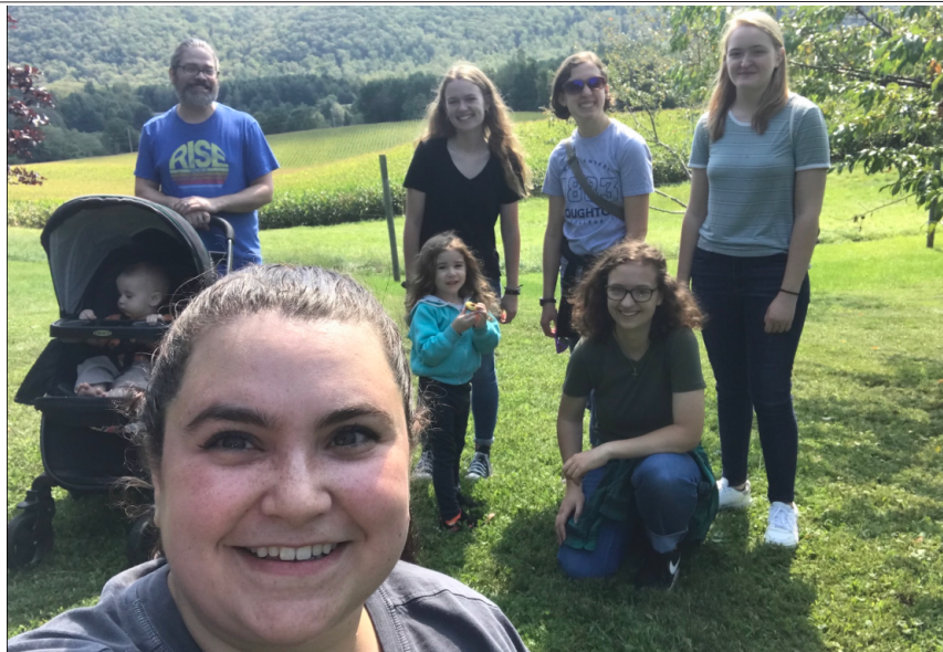
Pictured: SASF members on an apple picking trip earlier this semester.

The Salvation Army is a church, and provides social services to those in need. Their Mission