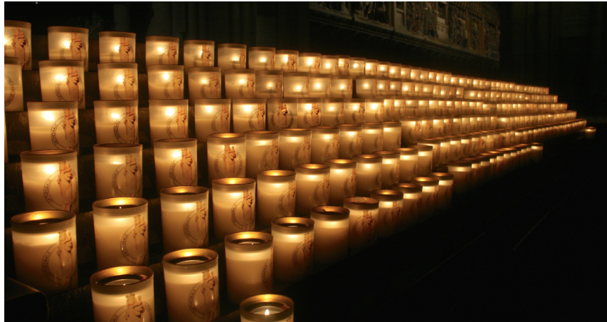
Pictured: Candles at a prayer vigil in Notre Dame at the COP-21 climate conference in Paris, 2015.